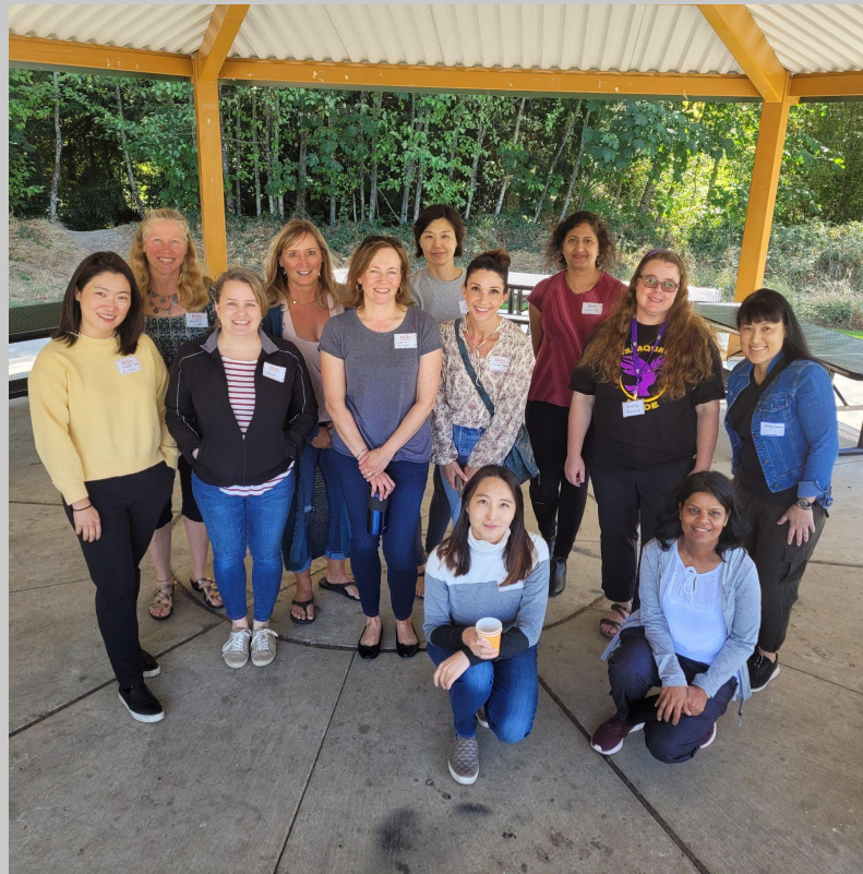
Past Event: Coffee at Central Park - Sept 7

Upcoming Event: Twin Falls Nature Hike Thursday, Sept. 30, 10am